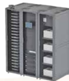
Integrated cabinet+network cabinet+battery cabinet