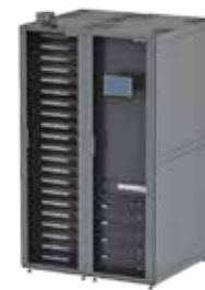
Integrated cabinet+network cabinet or Integrated cabinet+battery cabinet